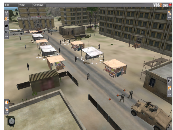
Figure 2. Layout of the example's market area.

In the SB scenario, the SB walks into a crowded market area; a BLUFOR patrol is observing the scene. The SB's goal is to destroy the BLUFOR unit by detonating the bomb he is carrying. In a variant of this scenario, the SB's goal is to maximise the civilian casualties. A diagram of the layout is shown in Figure 2.